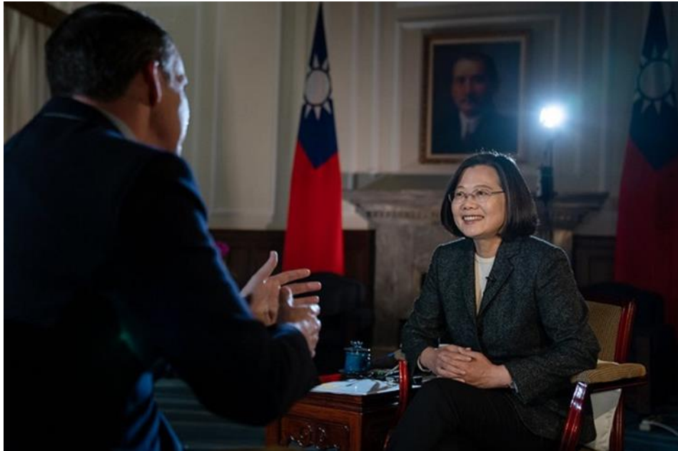
President Tsai is interviewed by BBC following her victory in Taiwan's presidential election.