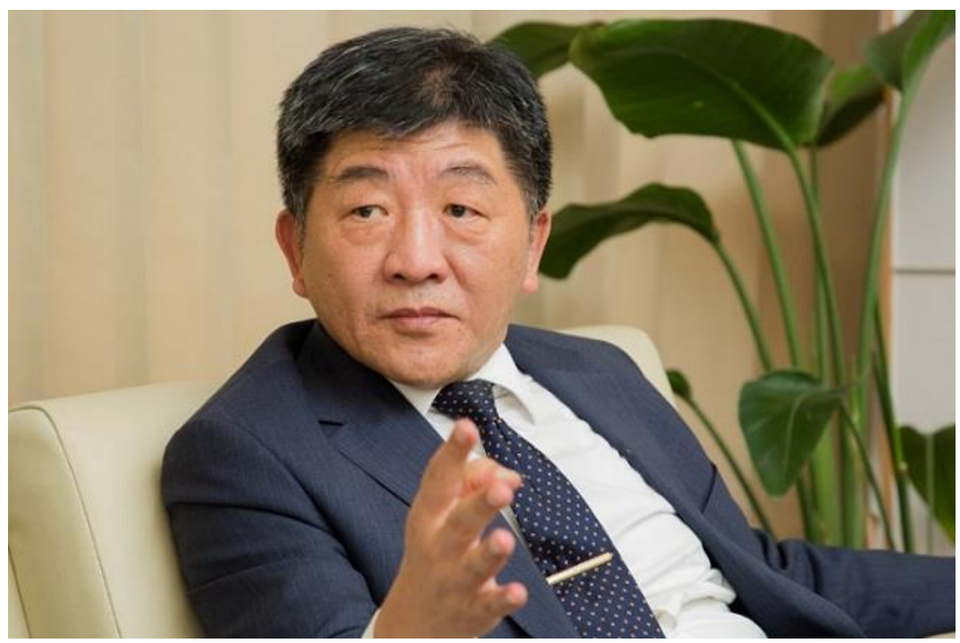
The Minister of Health and Welfare highlights Taiwan's advances in digital healthcare to call for its inclusion in 72nd WHA.