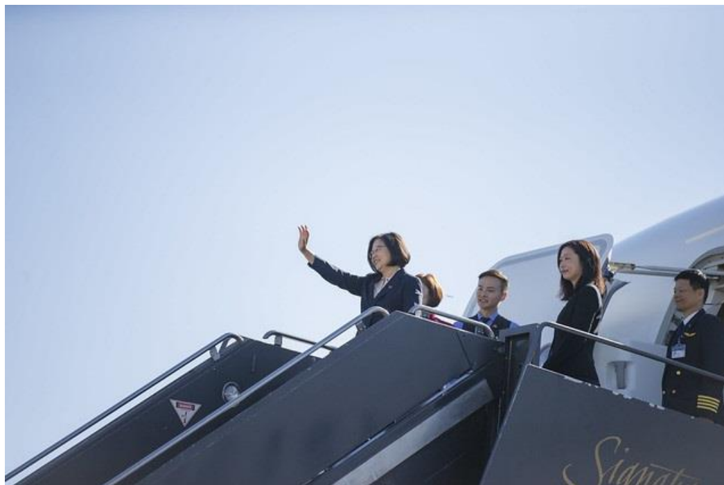
President Tsai returns to Taiwan after finishing her JFDS visits.