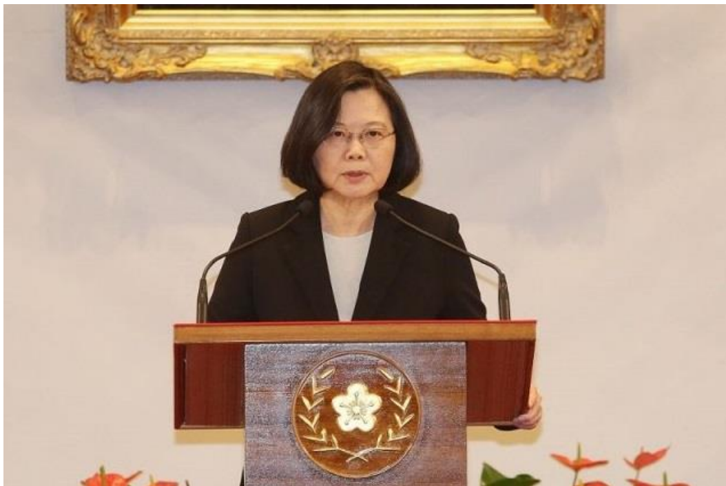
President Tsai Ing-wen rejects China's "one country, two systems" for Taiwan.