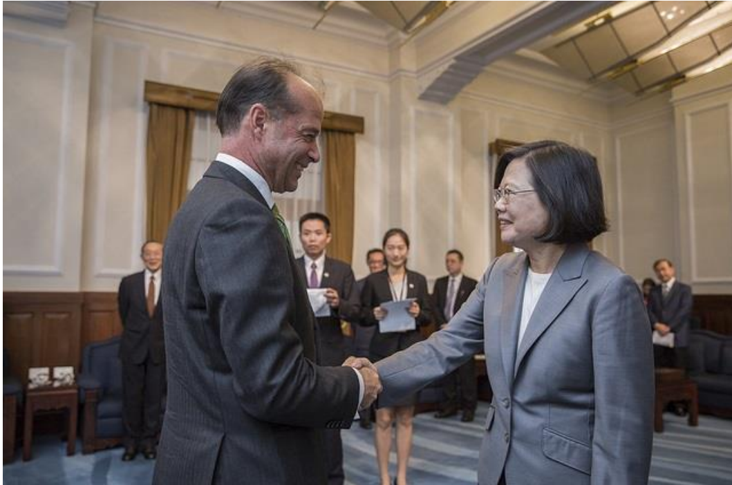
Taiwan President Tsai Ing-wen meets with UK Trade Policy Minister George Hollingbery.